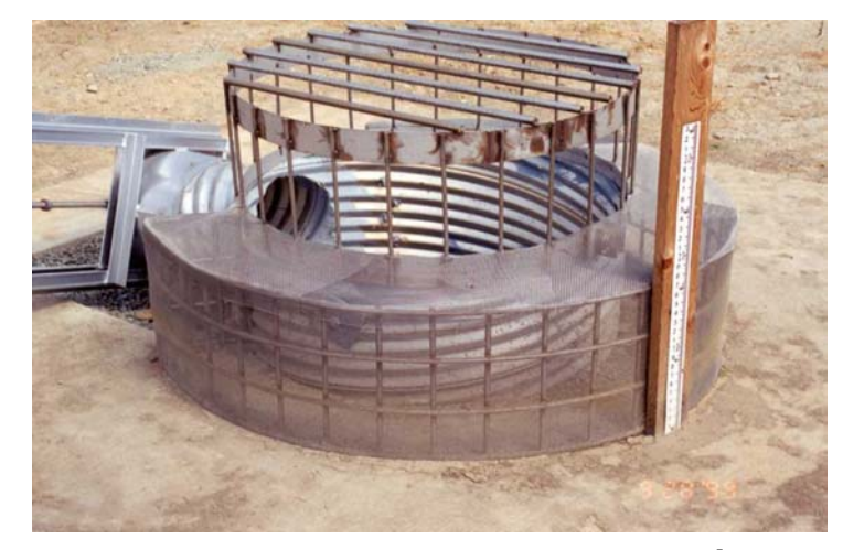
Figure 1 Example of Extended Detention Outlet Structure

The facility's drawdown time should be regulated by an orifice or weir. In general, the outflow structure should have a trash rack or other acceptable means of preventing clogging at the entrance to the outflow pipes. The outlet design implemented by Caltrans in the facilities constructed in San Diego County used an outlet riser with orifices sized to discharge the water quality volume, and the riser