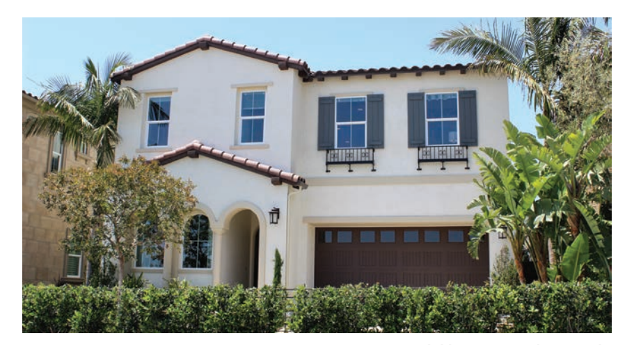
New model homes in Baker Ranch.