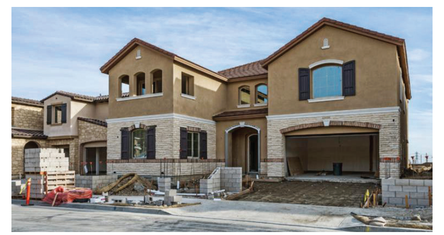
Progress on The Oaks model homes

Construction of The Oaks community at Portola Hills continues with model homes nearing completion and expected to open later this year. The Oaks will feature eight luxury model homes ranging in size from 2,700 square feet up to 5,200 square feet.