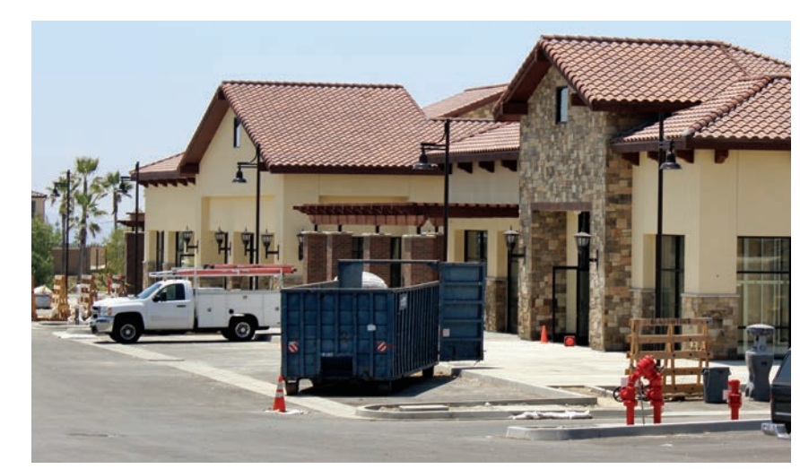
Construction continues at the new Baker Ranch Commercial Center